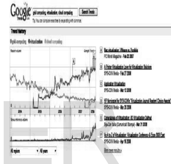
Fig. 1 Cloud computing in Google trends

The Cloud computing, which was coined in late of 2007, currently emerges as a hot topic due to its abilities to offer flexible dynamic IT infrastructures, QoS guaranteed computing environments and configurable software services. As reported in the Google trends shown in Figure 1, the Cloud computing, which is enabled by virtualization technology, has already outpaced the Grid computing.